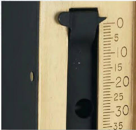
Easy to read graduations