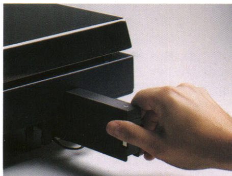
Quick Count is portable when equipped with an optional internal camcorder battery.