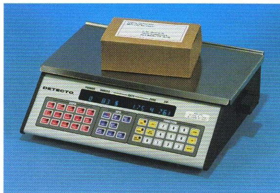
DETECTO's MS Series Scales feature clean lines and low-profile, compact design.

For fast pace mailroom processing, DETECTO's Delta Weigh feature weighs and rates mail automatically. You really benefit from the brilliant, easy-to-read, 1/2" high digital display and the sealed keypad that wipes clean. LED key annunciators identify chosen service functions at a glance.