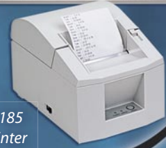
Model P185 Ticket Printer