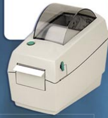
Model P220 Thermal Label Printer