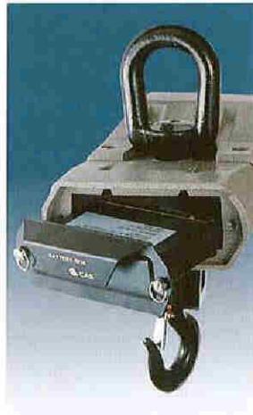
► Battery Pack Installation