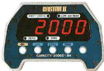
▲ Display & Keyboard